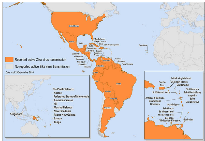
All Countries & Territories with Active Zika Virus Transmission; U.S. Centers for Disease Control and Prevention, November 2016

Since the emergence of Zika in Brazil in 2015, Zika virus has spread rapidly throughout Latin America and the Caribbean. Currently, Zika outbreaks are ongoing in 61 countries and territories, including in Mexico, where the highest numbers of cases are in the southern part of the country. However, the U.S. Centers for Disease Control and Prevention considers any travel to Mexico to be a risk for Zika infection. Individuals have been infected in popular tourist destinations including Cancun, Acapulco, Cabo San Lucas, Puerto Vallarta, Ixtapa, Mazatlan, and most recently, Ensenada, a coastal city in Baja Norte California. Local Zika virus transmission in Baja California Norte increases the risk that California residents will be exposed to the virus due to travel across the border. In addition, identification of local Zika virus transmission in Baja California increases the risk for local transmission in California due to the high volume of travel across the Mexico-California border daily and the presence of Aedes mosquitoes on both sides of the border. Active Zika virus transmission in the United States and U.S. territories has only been identified in Miami-Dade County in Florida, Cameron County in Texas, Puerto Rico, U.S. Virgin Islands, and American Samoa.